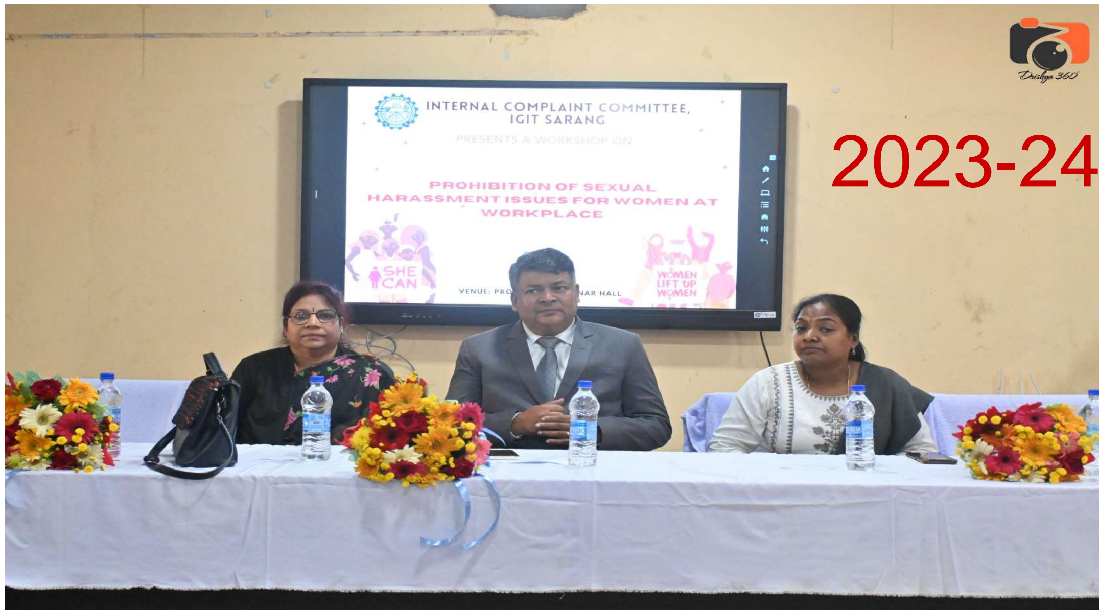
AWARNESS PROGRAM ON PROHIBITION OF SEXUAL HARASSMENT ISSUES FOR WOMEN AT WORKPLACE