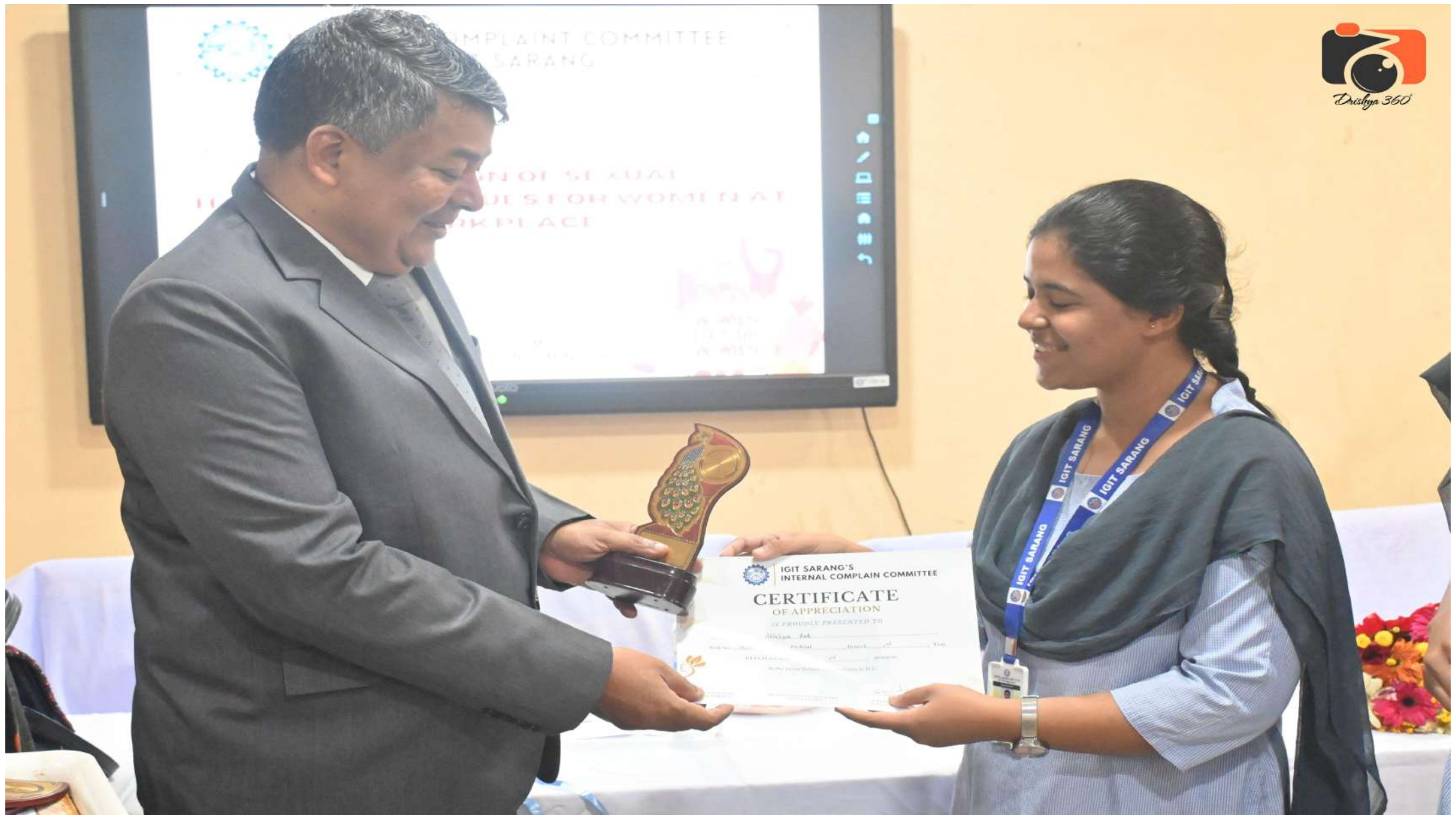
Award on Debate Competition on “ Diversity and Equity” organized by ICC, IGIT, Sarang