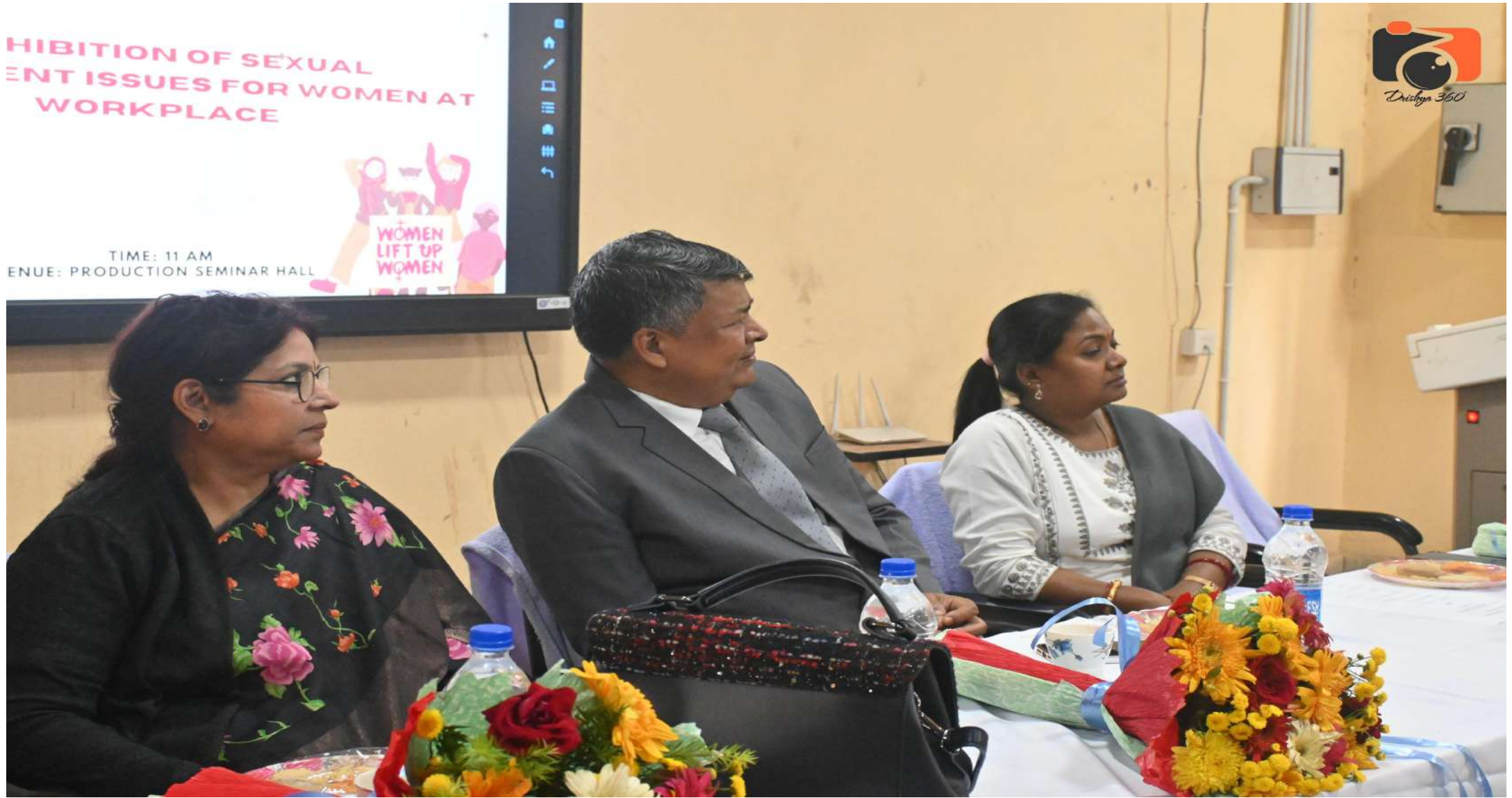
AWARNESS PROGRAM ON PROHIBITION OF SEXUAL HARASSMENT ISSUES FOR WOMEN AT WORKPLACE