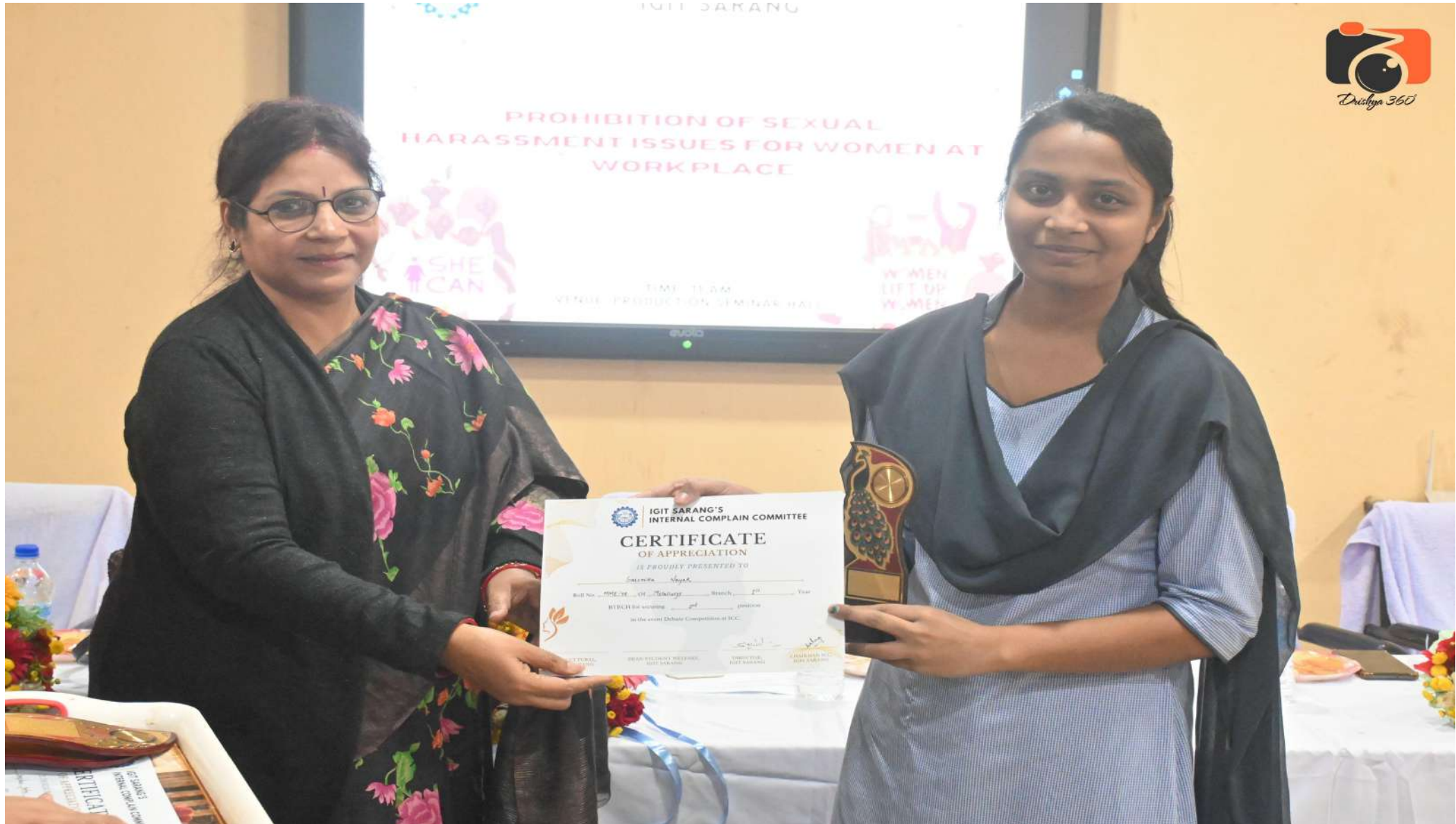
Award on Debate Competition on “ Diversity and Equity” organized by ICC, IGIT, Sarang