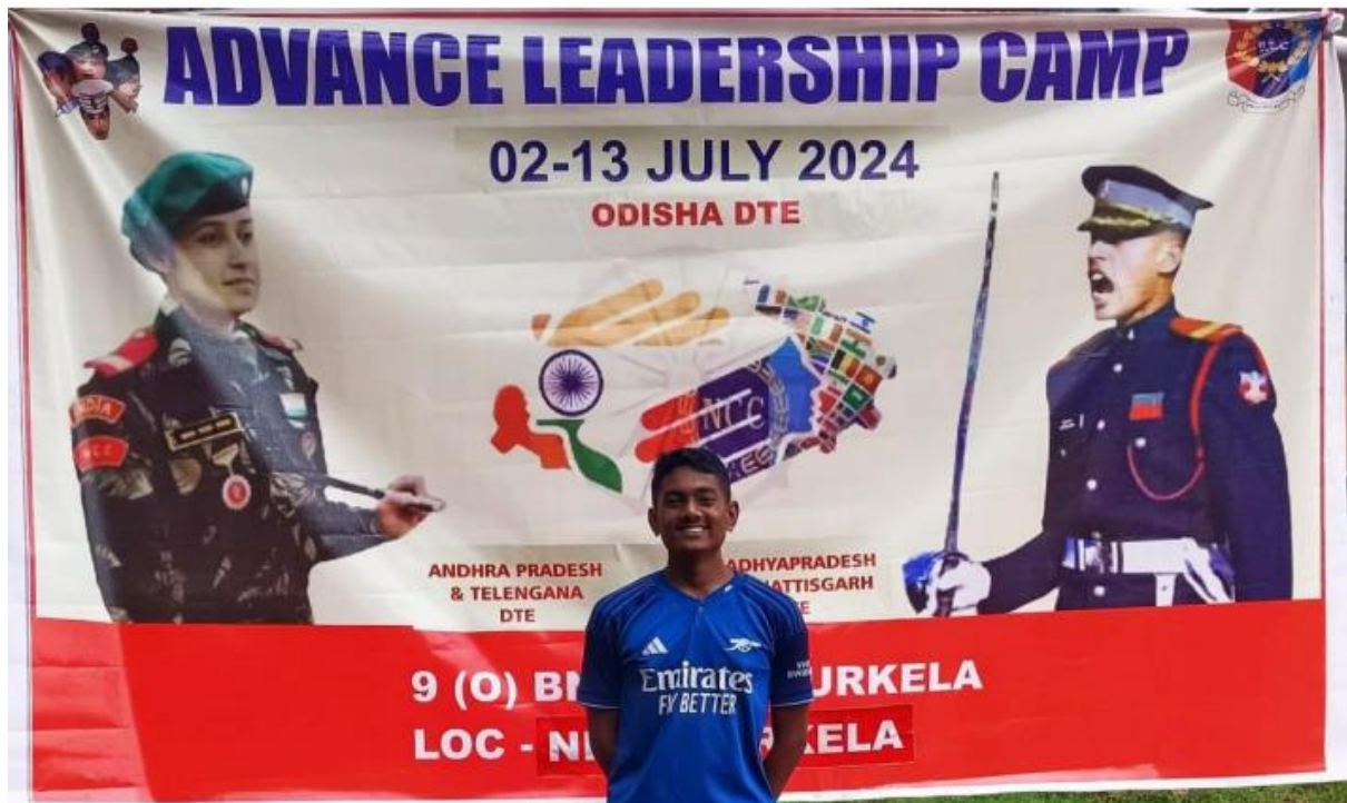
Figure 1 - Advance Leadership Camp, NIT Rourkela. It was organised by 9(O) BN NCC, Rourkela, Odisha from 02.07.2024 to 13.07.2024