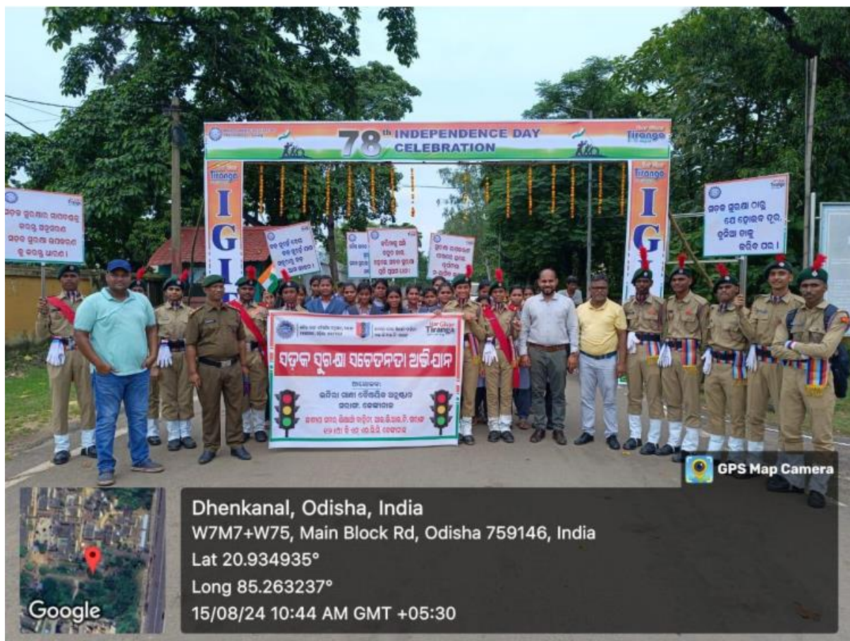
Figure 3 – Road Safety Awareness Rally. This rally was organised by Indira Gandhi Institute of Technology, Sarang & IGIT NCC on dated 15.08.2024.

Road Safety Awareness Rally was organised by Indira Gandhi Institute of Technology, Sarang & IGIT NCC on 15.08.2024. Around 60 students from the Institute had participated in the rally.